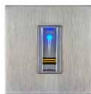
Ekey Outlet Mounted RFID finger scanner

In addition, Vantage also integrated the Ekey net solution in its showroom, located at its European headquarter. Different types of finger scanners are installed which all demonstrate the endless possibilities and advantages of this integration solution within building automation.