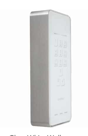
Glass White Wall-mounted