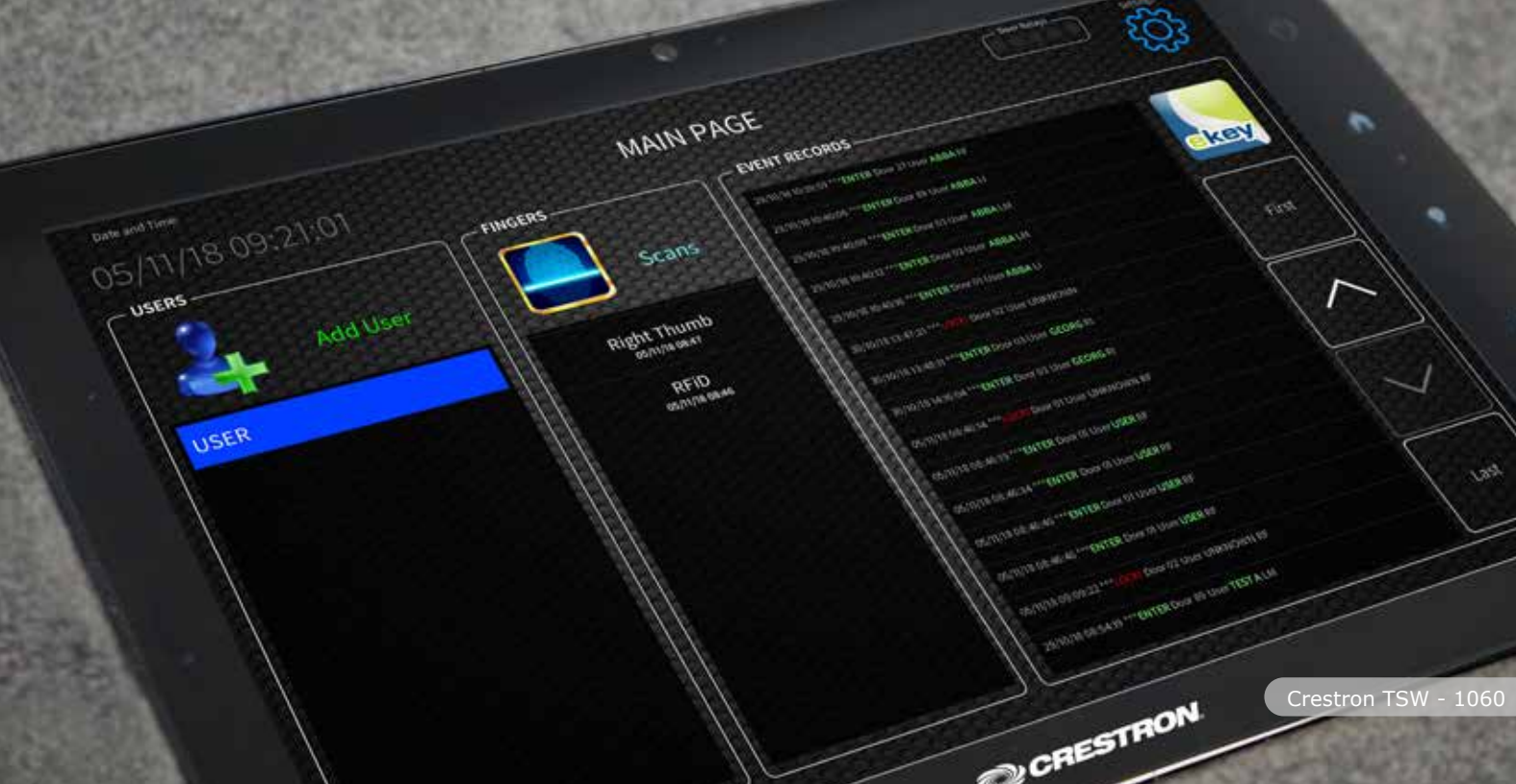
Crestron TSW - 1060